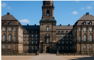
THE DANISH PARLIAMENT