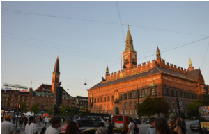
THE DANISH PARLIAMENT